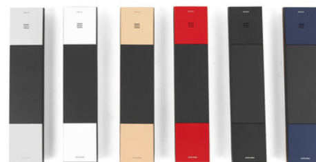
Color Options Available

Click on any image to be directed to our website.